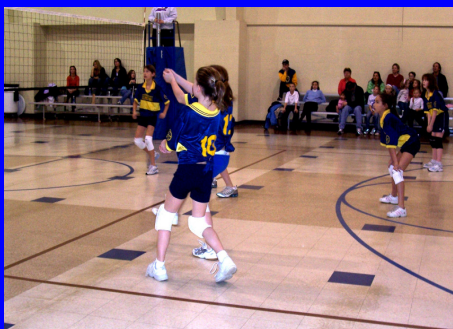
4th Grade Girls' Volleyball Team

New and exciting activities are introduced with student interest. We believe that our extra-curricular activities help enrich the education of our students.